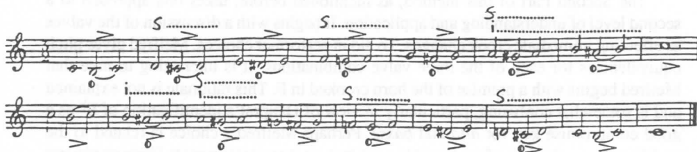
Figure 4 Sample leading-tone exercise, from Meifred, page 9.

Next, Meifred addresses one of his most important issues, the treatment of the leading tone. As mentioned before, it is his general attitude that notes in a leading-tone position should always be lightly stopped, to preserve the countenance and intonation. This forces the combination of the valve and the hand, since the valves allow the tonic and dominant of any key to be played open, so that the leading tone can be produced with the same fingering, while the hand, lightly stopping the bell, lowers the pitch. An example of this type of exercise is provided in Figure 4 below. As mentioned before, Meifred notates hand positions below the staff and valve combinations above (S = first valve, I = second valve, ..... = continue to hold the valve down).